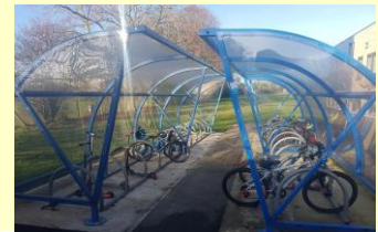
Mrs A Peart

The children's bicycle and scooter shelters are both now in one place alongside the new building at the back of the school. The shelter next to the canteen is now for staff bicycles only. Please make sure your child knows about cycling and scooting to school safely and wears a helmet. We recommend that bikes and scooters are locked. For the safety of everyone, please do not let your child ride their bike/scooter on the school site. Thank you.